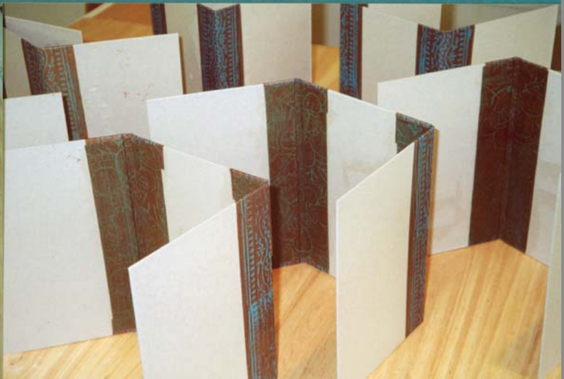
work-in-progress on red thread edition