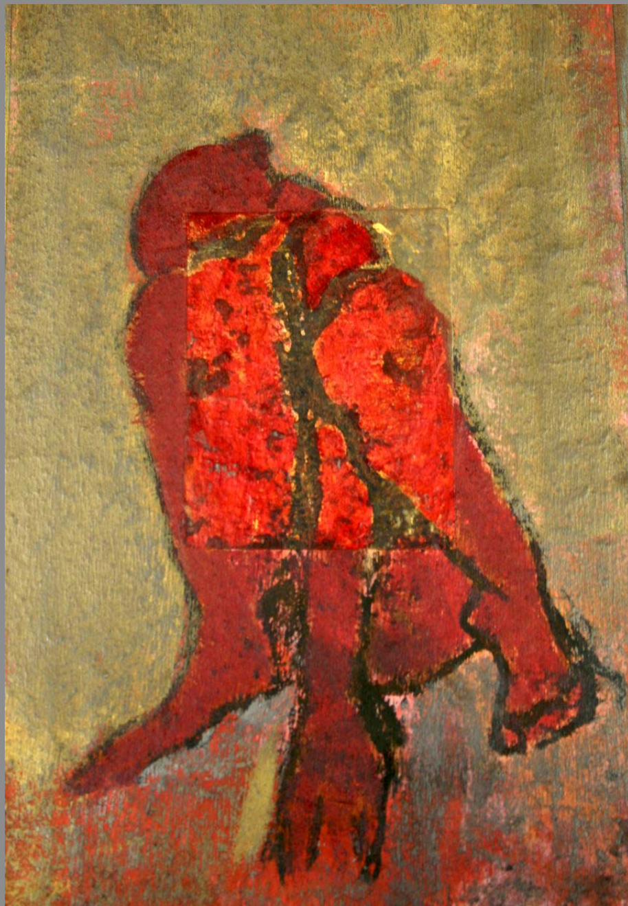
detail from red thread , artist book, 14x21 inches mixed-media collage, 2007