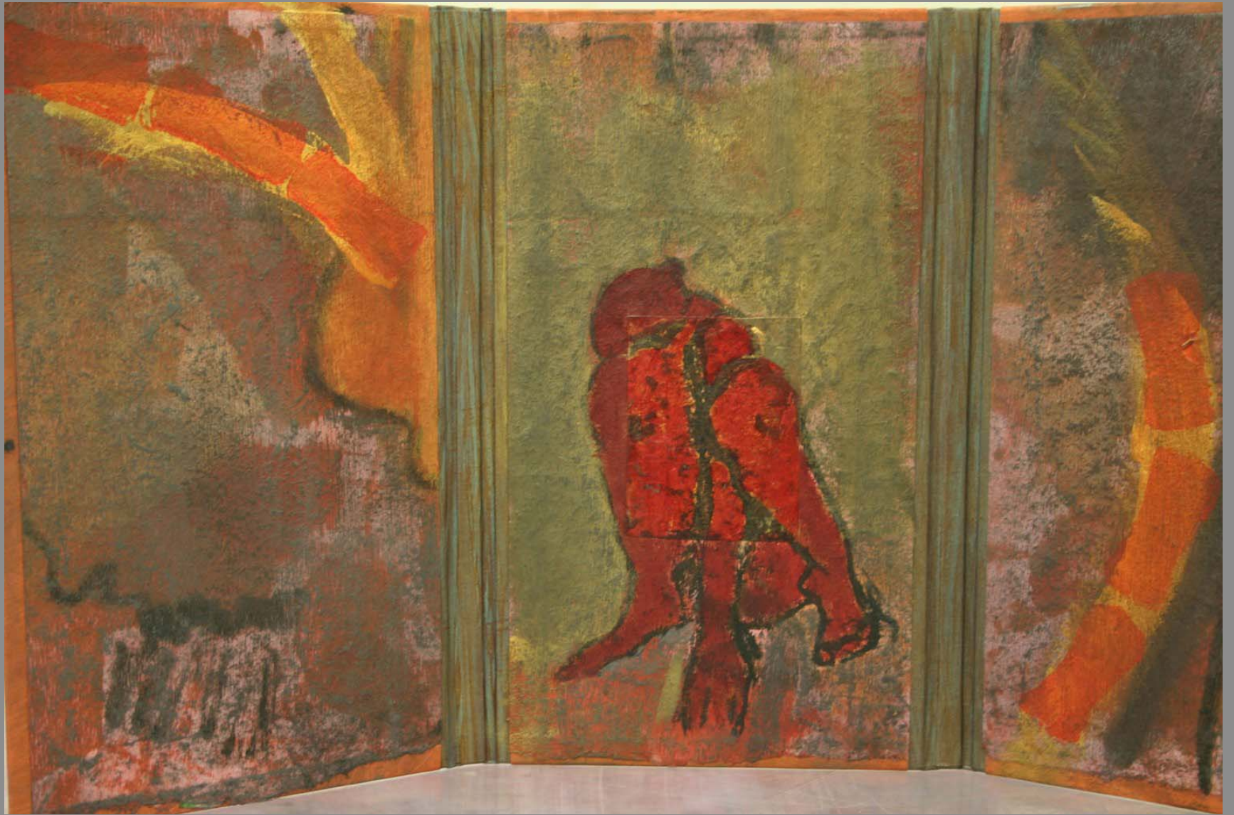
red thread , artist book, 14x21 inches mixed-media collage, 2007