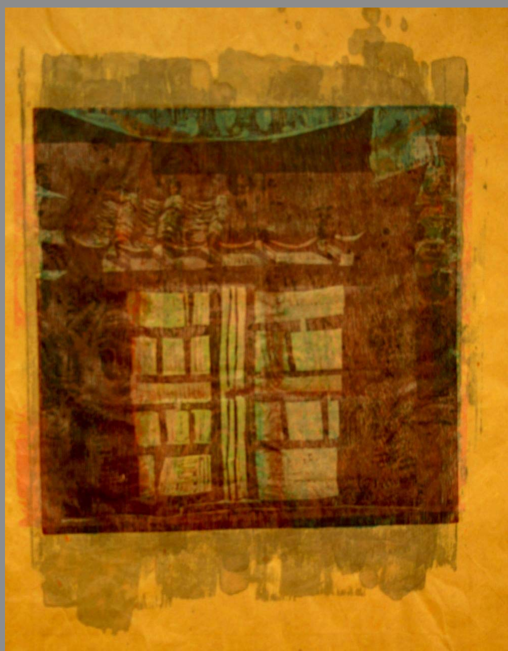
small mixed-media prints, 2006